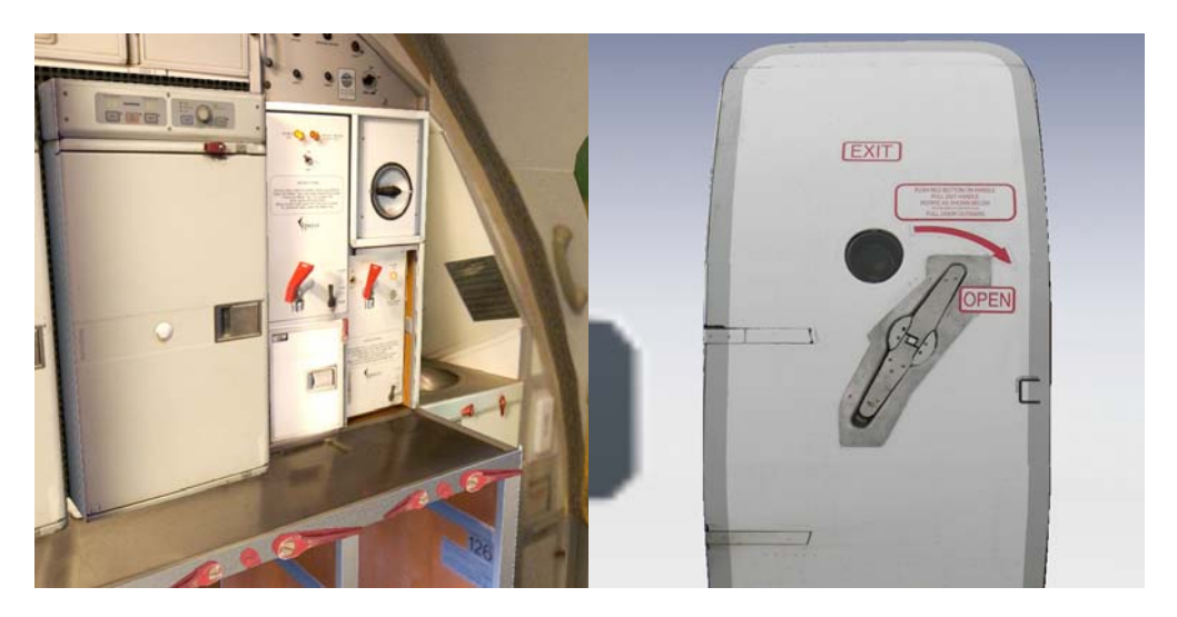
Figure 1: Aircraft door mechanism and catering oven.

3DVSL developed a desktop simulator from a detailed photographic survey of a Boeing 757. The simulator included the operation of all doors, location of ovens, cockpit controls of relevance, cargo hold etc (figure 1). It also featured optional reduced visibility simulating a smoky environment, and captured the difficulty of passing through small spaces with a BA system. The aim is to establish a library of aircraft types and variants which could be used by fire fighters around the world.