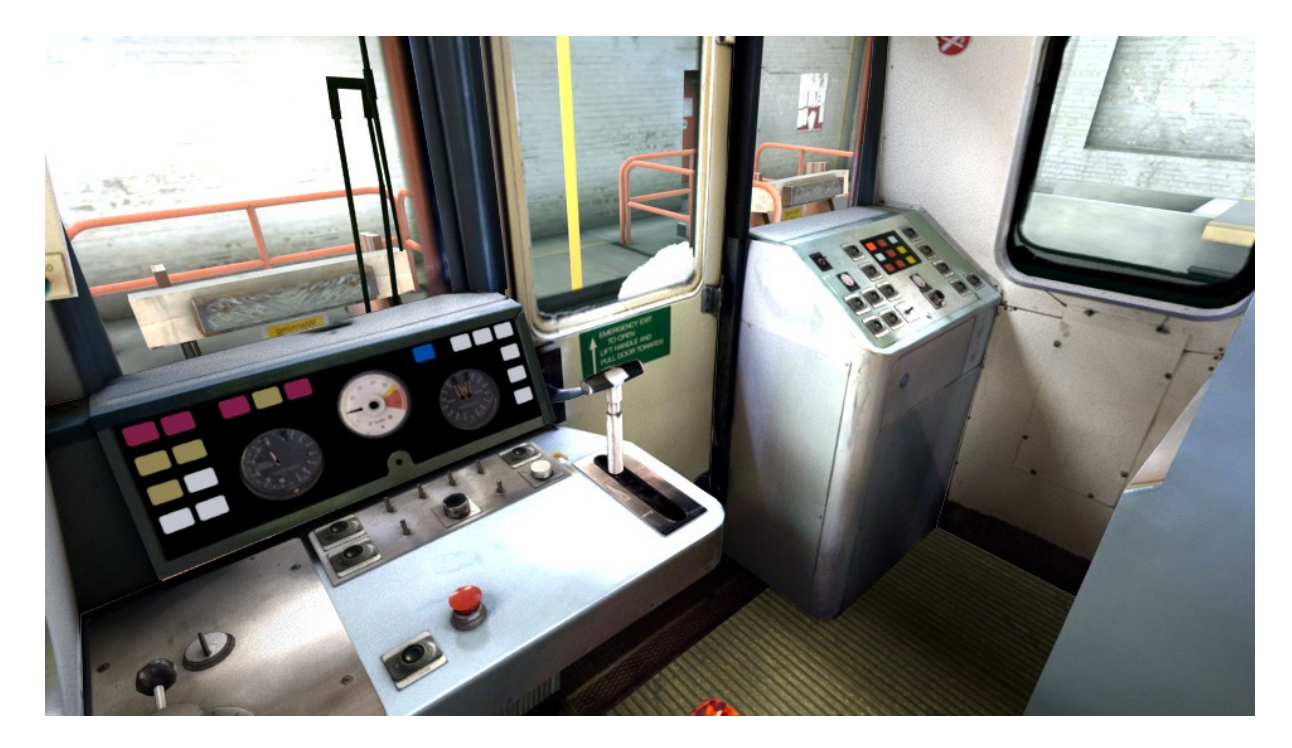
Figure 3: The virtual SPT train cab with instruments and controls..